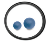
Food Contact Seals and Ground Rubber Balls