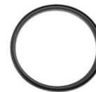
Brine Seals & Food Contact Seals