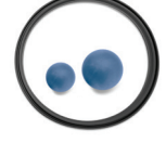
Food Contact Seals and Ground Rubber Balls