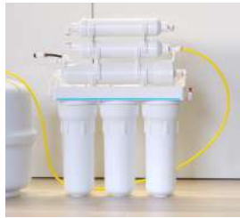
Drinking Water Filtration