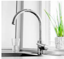
Faucet & Fixture