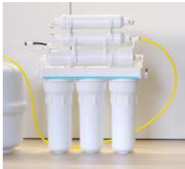
Drinking Water Filtration